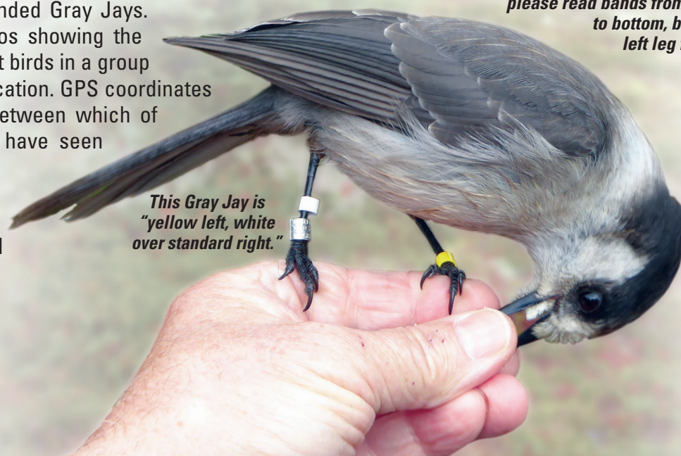
This Gray Jay is "yellow left, white over standard right."

If reporting coloured bands verbally, please read bands from top to bottom, bird's left leg first.